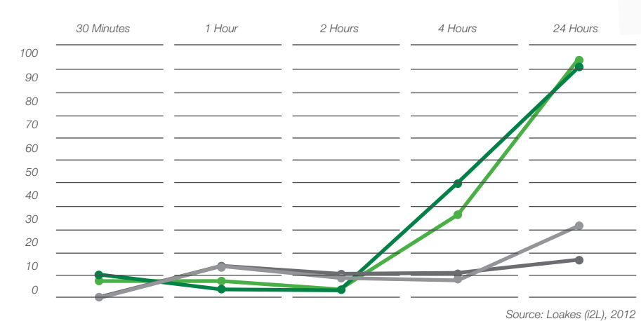
X=Mortality (%); Y=Time Mythic® SC on ceramic Mythic® SC on wood Control on ceramic Control on wood

Percentage reduction in the population of black ants (Lasius niger) on different surfaces.